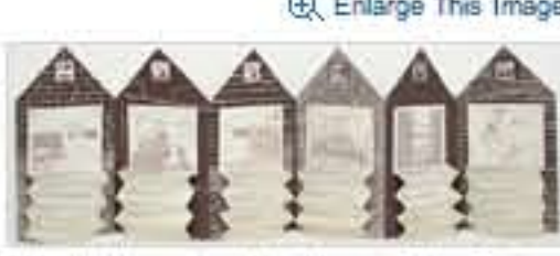
"What's Happening With Momma?" by Glanissa Slight.

(2004), a lovely miniature book in the shape of a clock that was in her grandmother's home, which opens up to reveal silkscreen pictures on bits of balsa wood strung together.