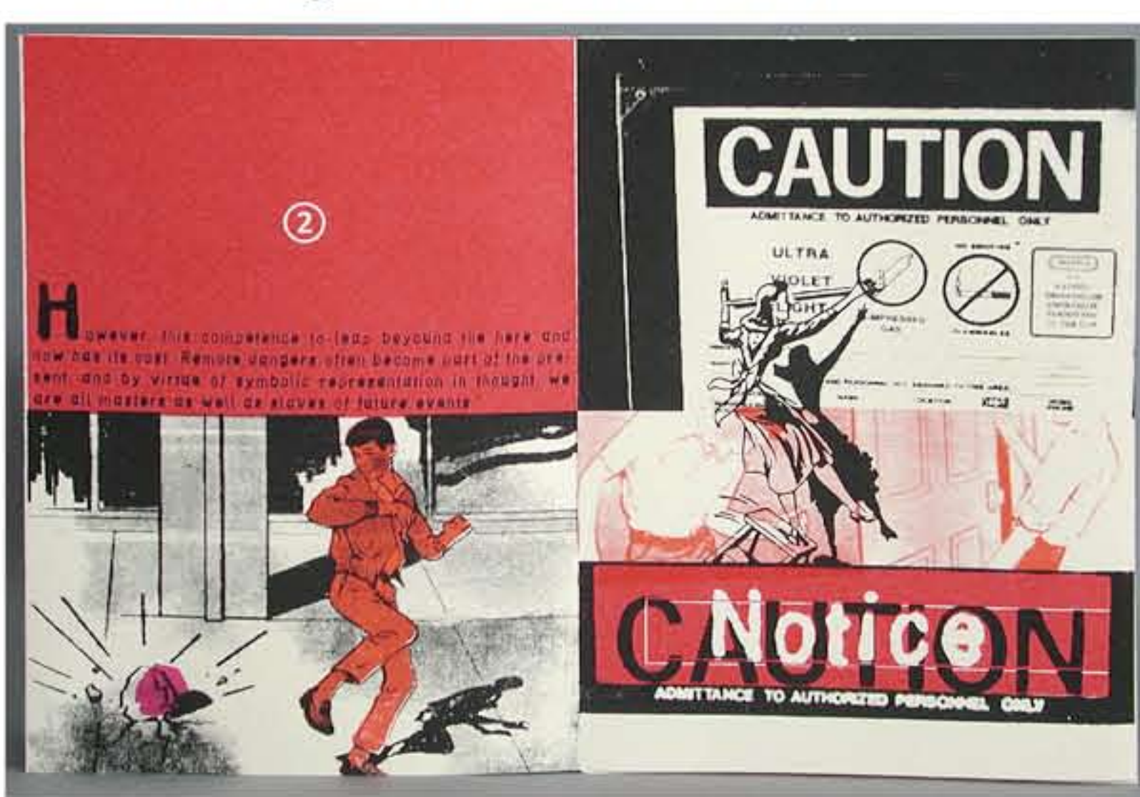
COMPELLING "Book of Warnings" by Daniela Deeg. By BENJAMIN GENOCCHIO Published: March 12, 2009

Artists have been active in printing and book production in Europe since the Middle Ages, but it was not until the 20th century that the artist's book — a work of art in book form — came into its own. It happened first in France and Germany with the modern avant-garde and then later in Russia and Italy, where Futurist artists devoted themselves to making experimental books that exploded the assumptions of standard book production.